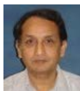
AAPPS-DPP chair & 2024 IOC chair Abhijit Sen

AAPPS-DPP ( http://aappsdp.org/AAPPSDPP/ ) is organizing body of this conference. MIP co-organizes this conference and acts as LOC.