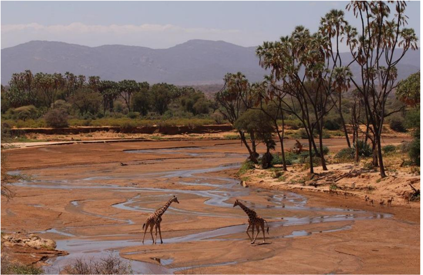
The Ewaso Nyiro River can get this low in March, attracting much wildlife from all around.