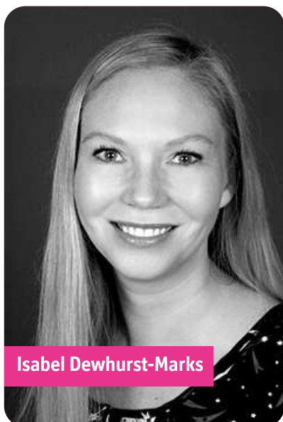
Managing Director, WORKTECH Events